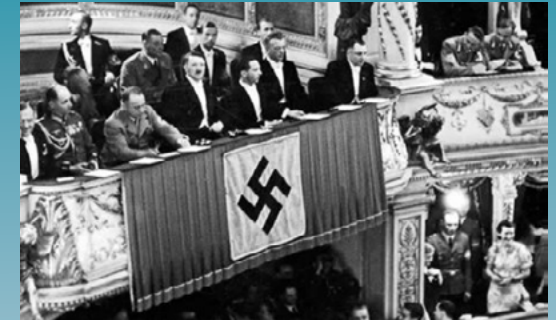
Adolf Hitler at the opera in Vienna, with Josef Burckel, Joseph Goebbels, and Martin Bormann

Lehár founds a publishing house, Glocken-Verlag ("Publishing House of the Bells"), to print his music. He gains the rights to all of his music except The Merry Widow .