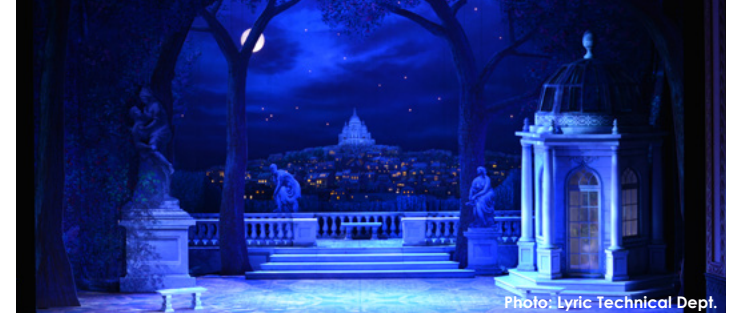
Hanna's Garden, Act II of The Merry Widow.