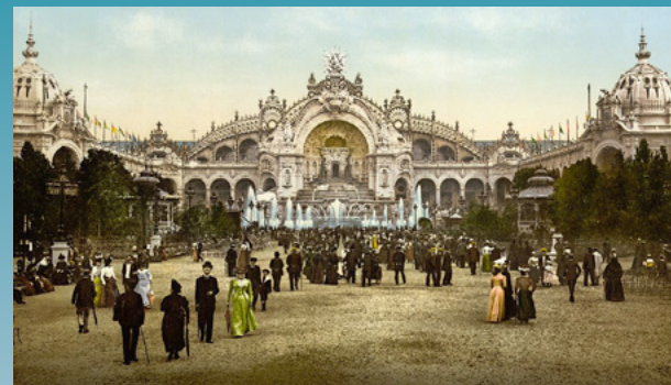
Le Chateau d'eau and plaza, Exposition Universelle, 1900, Paris, France

Merry Widow composer Franz Lehár is born in Komárom in the Austro-Hungarian Empire (now part of Slovakia).