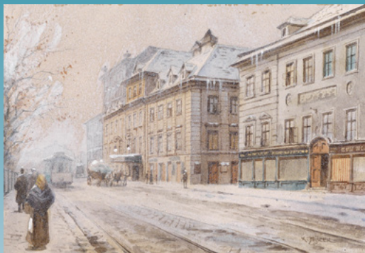
The Theater an der Wien painted by Carl Wenzel Zajicek.