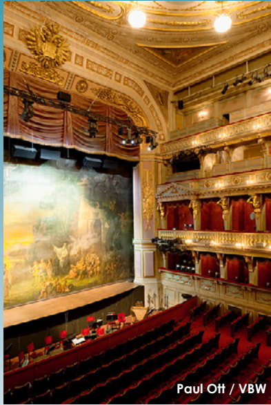
Paul Ott / VBW