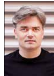
EDWARD GARDNER ( Conductor ) Lyric Opera debut

of the Guard ), Towpath Players in Rochester, New York (Tony/ West Side Story , Mr. Darling and Captain Hook/ Peter Pan ), and with Chicago Opera Theater, Madison's Opera for the Young, Eastman Opera Theater, and the College Light Opera Company in Falmouth, Massachusetts. He has sung a wide concert repertoire throughout the Chicagoland area and has been heard in numerous musical-theater presentations at the Grant Park Music Festival.