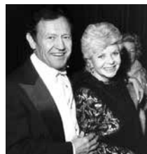
Mr. and Mrs. Jay A. Pritzker