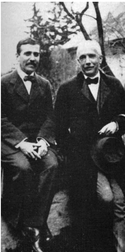
One of few surviving photos of Hofmannsthal (left) and Strauss.

thus motivating the Italian intriguers' change of allegiance to Octavian). But contrary to the usual assumption, the famous waltz concluding Act Two wasn't Strauss's idea at all: "Try and think of an old-fashioned Viennese waltz," Hofmannsthal wrote to the composer in April 1909, "sweet and yet saucy."