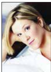
ALICE COOTE ( Octavian – March 4-13) Previously at Lyric Opera: Four roles since 2001-02, most recently Composer/ Ariadne auf Naxos (2011-12); Dejanira/ Hercules (2010-11); Orlofsky/ Die Fledermaus (2006-07).

The renowned English mezzo-soprano's triumphs in Strauss internationally include both Der Rosenkavalier (Los Angeles, London, Vienna, New York, Geneva, Munich) and Ariadne auf Naxos (Lyric, Munich, London, Paris, Toronto). She is a favorite at many of the world's great opera houses, including – in addition to those already mentioned