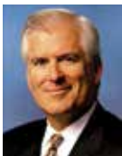
Miles D. White