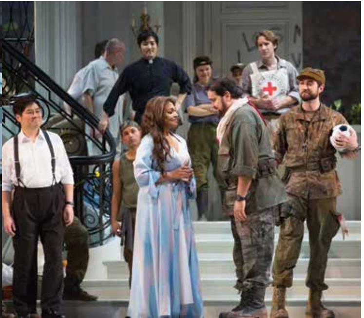
In Bel Canto (2015-16, world premiere), Danielle de Niese, portraying opera diva Roxane Coss, is pictured in her concert gown and then in the clothes she wears after being taken hostage.