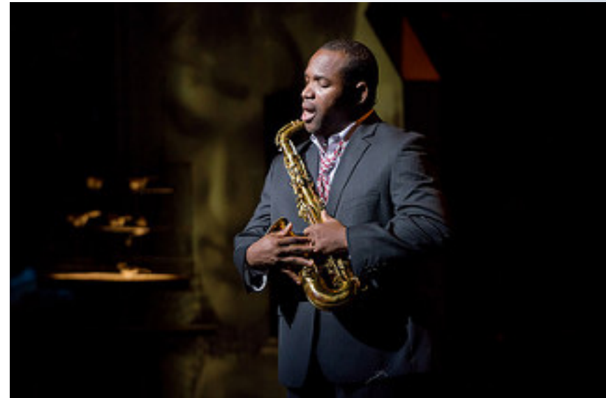
Yardbird at the Apollo Theater

2015 Charlie Parker's Yardbird premieres in Philadelphia.