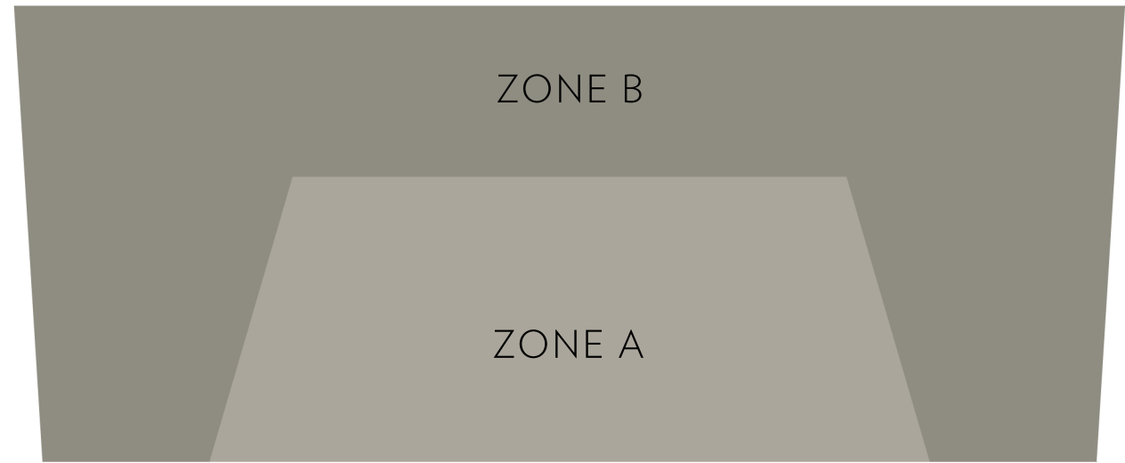
FLOORS 5 & 6