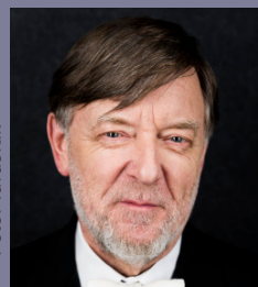
Sir Andrew Davis, Music Director