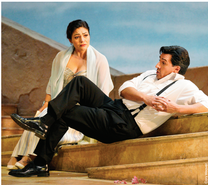
Charles Castronovo pursues Ailyn Pérez.