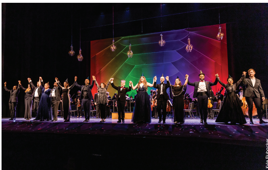
The entire Ensemble takes the stage for a final bow.