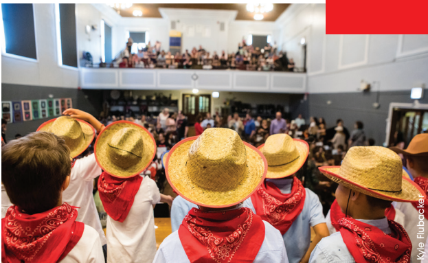
A view from the stage at Smyser Elementary, at the final session of an Elementary Opera Residency.