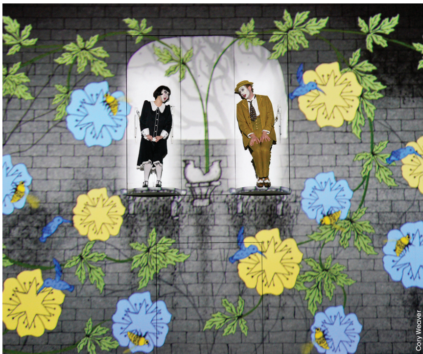
The production design was inspired by the silent films of the 1920s.