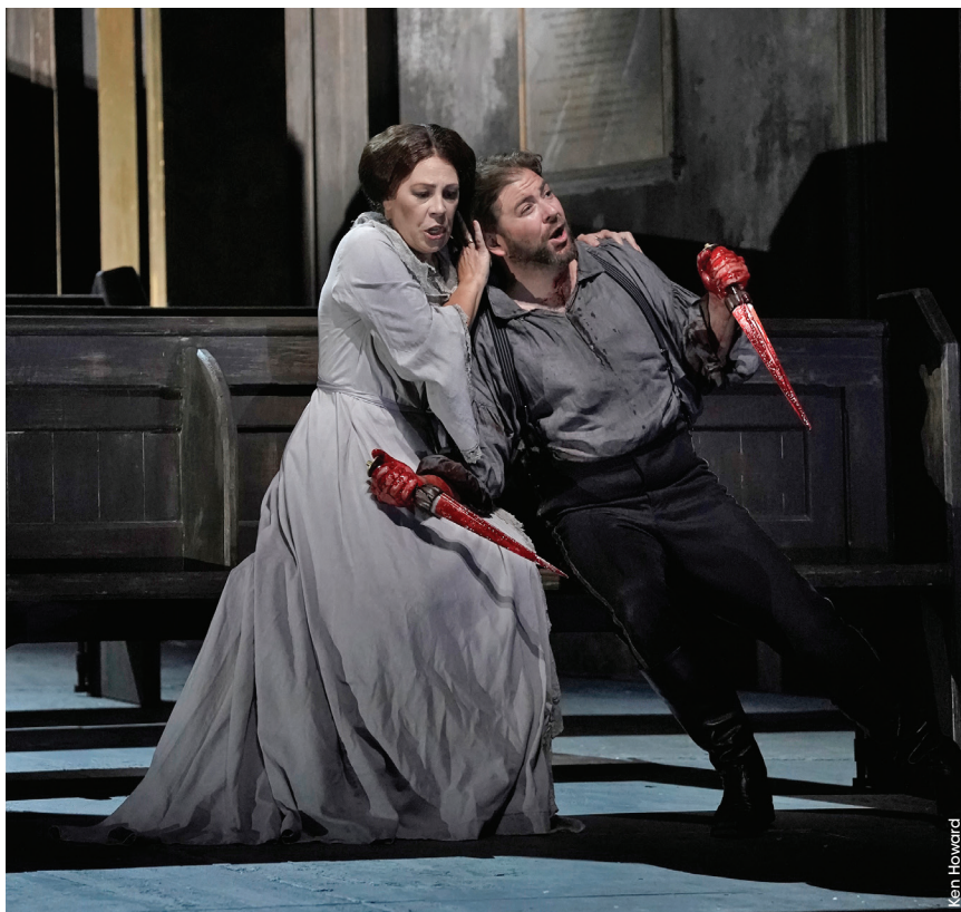
Sondra Radvanovsky and Craig Colclough starred as the troubled, ambitious couple.

September 17, 23, 30, and October 3, 6, 9