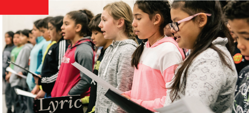
For many students, the Opera Residency Program is their first contact with the art form.