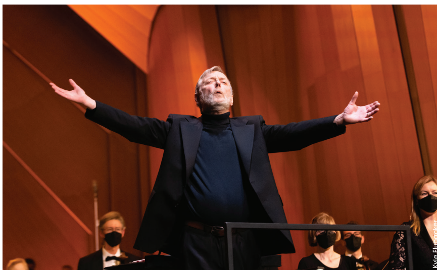
Sir Andrew Davis was welcomed upon his return to the Lyric stage.