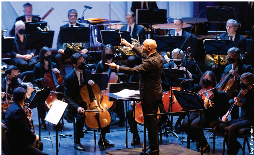
Enrique Mazzola conducted the virtuosic all-Verdi program.