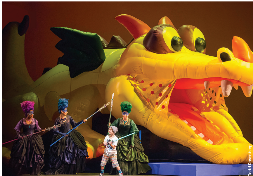
Elements of various operas come to life for the children visiting their grandfather.