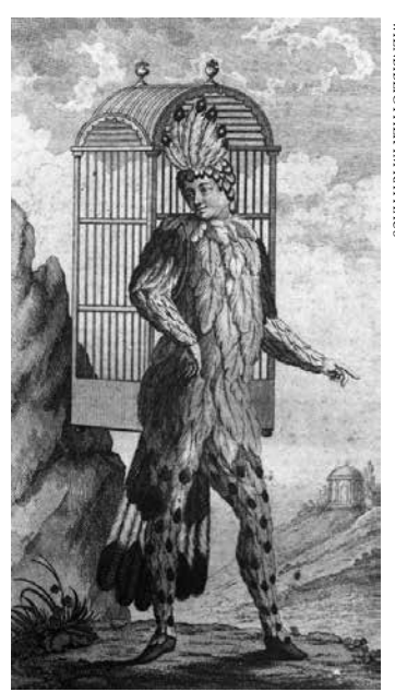
In addition to serving as the opera's librettist, Emanuel Schikaneder also created the role of Papageno. He is depicted here in an engraving by Ignaz Alberti from 1791, at the time of the opera's premiere.

When the performance is over, try discussing it with your companions and any other opera lovers you know! You can continue your pleasure in The Magic Flute for hours – even days – by exchanging ideas about it. Here are some topics we can suggest: