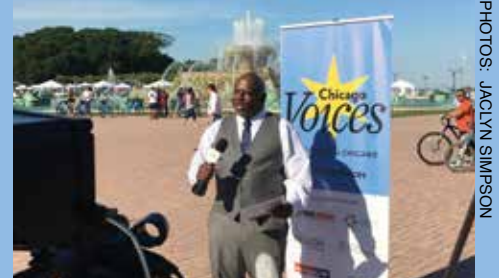
Memorable moments from the city-wide Chicago Voices SING initiative.