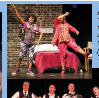
Highlights from "Stories and Songs of Chicago," the evening of Community Created Performances presented at the Harris Theater.